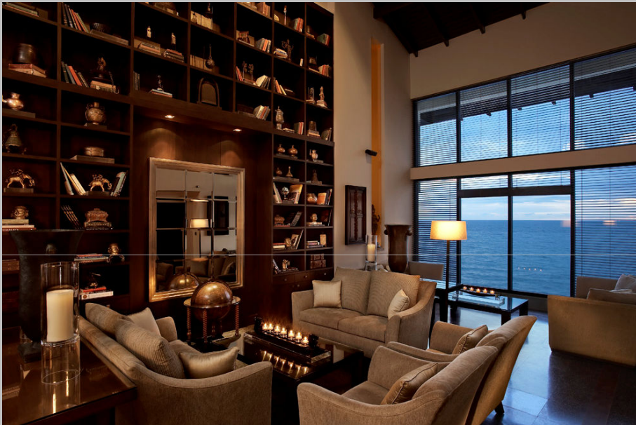
The Club Lounge

Imagine a private club within a luxury hotel...this is The Club at The Leela Kovalam. It gives you stunning rooms looking out onto the Arabian Sea and where you can avail of your own private library and lounge (complimentary high-tea is served every day).