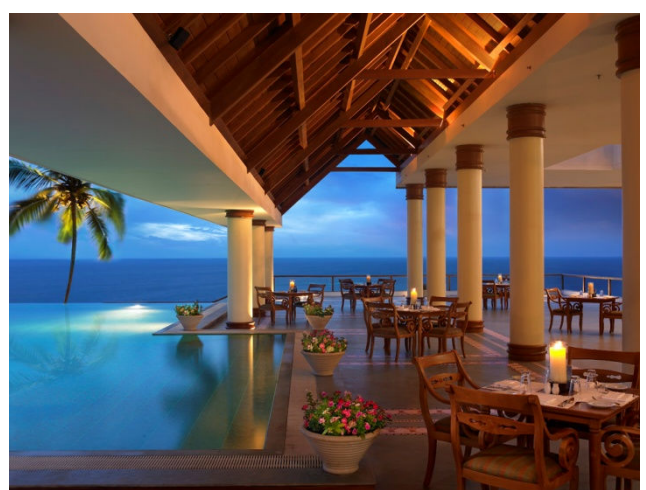
The Terrace Restaurant