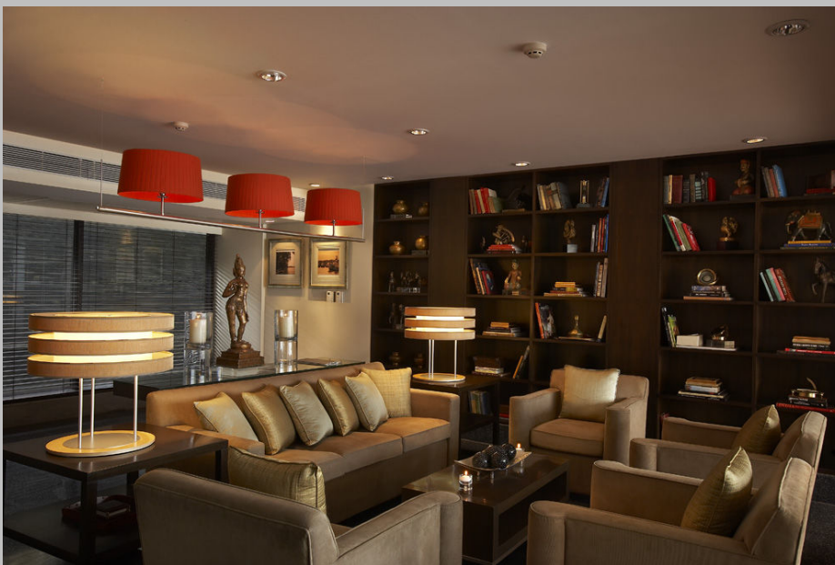
The Club Library